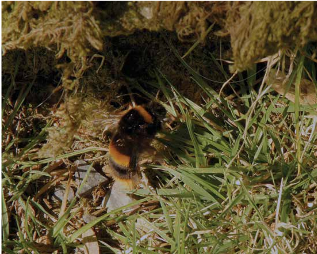
Eight species of bumblebee have been seen at the hedge, along with many other pollinators. This queen Bombus terrestris was searching for a nesting site.

When I lay the hedge, I shall take care to leave behind as much dead and decaying wood as possible. Meanwhile, I shall endeavour to ensure that stocking levels in the adjacent field remain light so that the margin can produce flowers, while I shall continue to cut back the Bramble growth on the lane side every year or so in order to permit easy vehicle passage (and, I must admit, to give visitors the impression that the farm is cared for). The ditch is likely to need a light clean with a digger in a few years' time, but I shall keep the sides shallow and the bottom muddy.