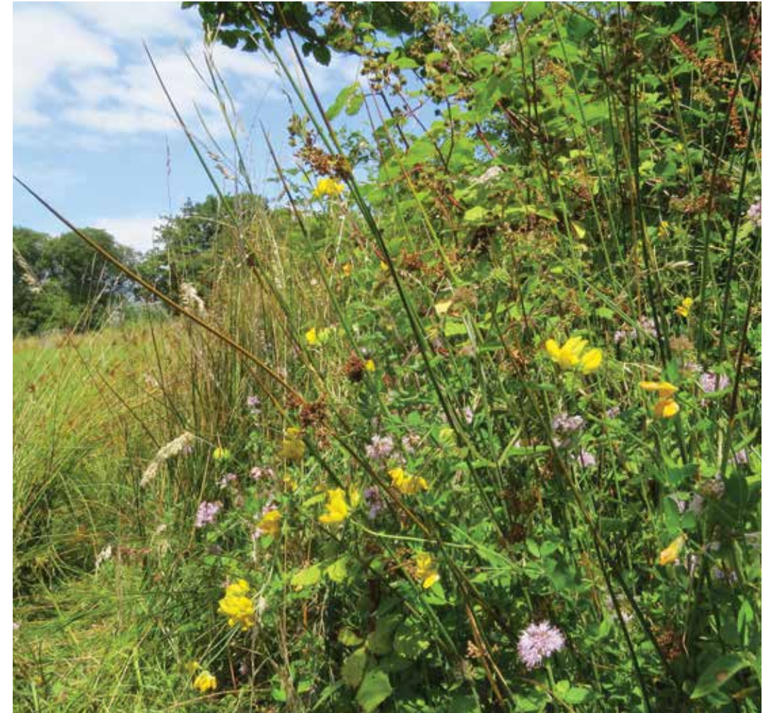
Flowers in the field-side margin: Water Mint and Greater Bird's-foot-trefoil, with Soft Rush. Robert Wolton

The 1995 UK Biodiversity Action Plan for hedges states that more than 600 plant species, 1,500