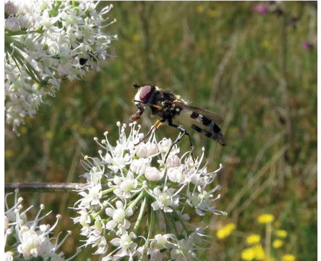
Tall flowering umbellifers such as Wild Angelica in the hedge margins were very popular with flies, such as this hoverfly Leucozona laternaria , as well as with other insects. Robert Wolton

which I recorded, an analysis of the species present reveals that the hedge is of particular conservation significance for insects (mainly beetles, flies, bees and wasps) associated with decaying wood, both heartwood decay and bark and sapwood decay. As an indication of the importance of these micro-habitats, 162 of the true-fly species and 16 beetles recorded at the hedge are known to be associated as larvae with decaying wood, including associated fungi. David Clements and Keith Alexander (2009), after sampling the invertebrates of hedges on an intensive farm in Somerset, hedges that lacked large ancient trees, concluded that old hedges are an important habitat resource for ancient-woodland and old-growth invertebrates of dead and decaying wood. They noted that networks of old hedgerows can support a range of such species similar to that of substantial areas of ancient semi-natural woodland or wood-pasture, including good numbers of scarce species.