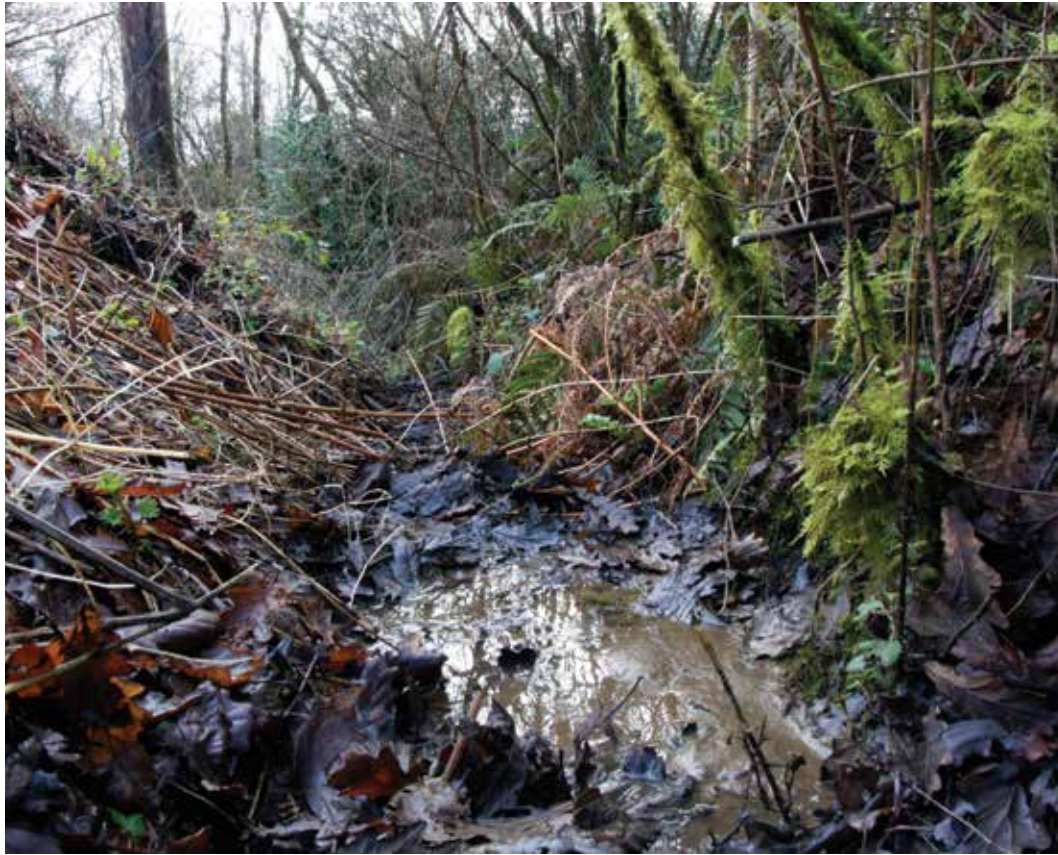
The shallow ditch which forms part of the hedge produced large numbers of non-biting midges and other flies, as well as records of molluscs and Palmate Newt Lissotriton helveticus.