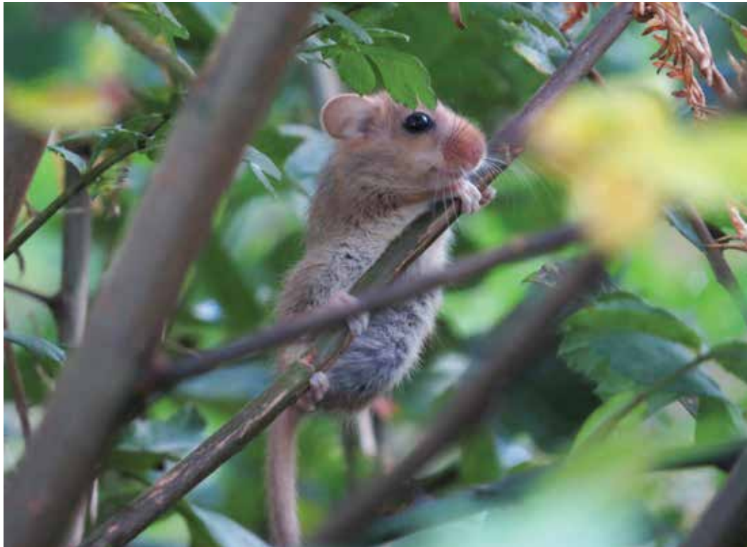
This young Hazel Dormouse was born in a nest in the hedge.

Duncock, Song Thrush, Spotted Flycatcher Muscicapa striata , Marsh Tit Poecile palustris , Willow Tit P. montana , House Sparrow Passer domesticus , Bullfinch, Brown Long-eared Bat Plecotus auritus , Soprano Pipistrelle Pipistrellus pygmaeus , Hedgehog Erinaceus europaeus and Hazel Dormouse.